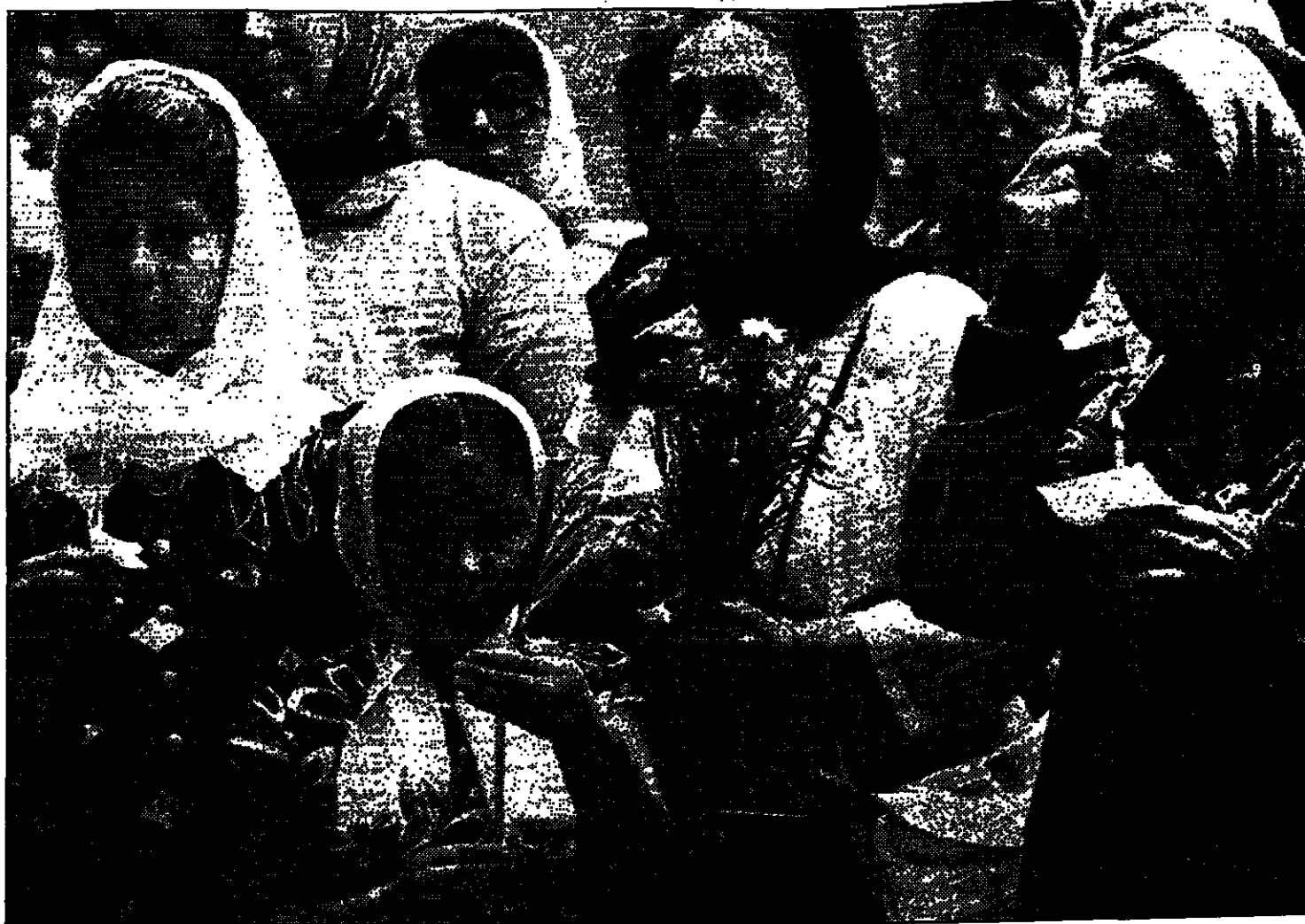
Russian monarchists attend a commemorative service yesterday for Czar Nikolay Romanov II, whom the monarchists have asked the Orthodox Church to saint.

No group has claimed responsibility for Sunday's vehicle bomb that wrecked a hotel in Enniskillen, 130 km southwest of Belfast.